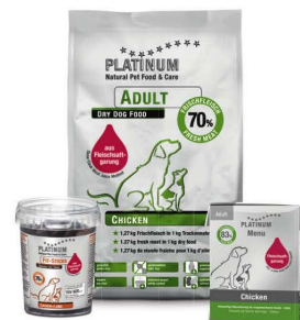
Snacks | Dry food | Wet food

Free advice 0800 158 80 25 | info@platinum.co.uk | www.platinum.co.uk